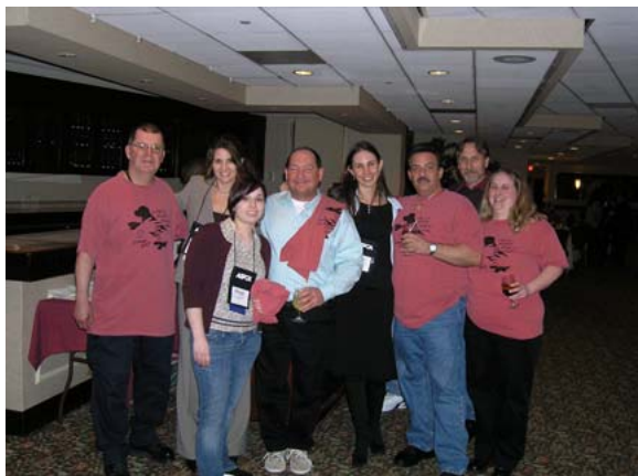
Members of AWFNJ and NJCACOA