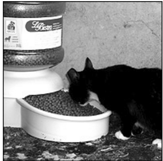
Automatic feeders ensure a steady supply of food