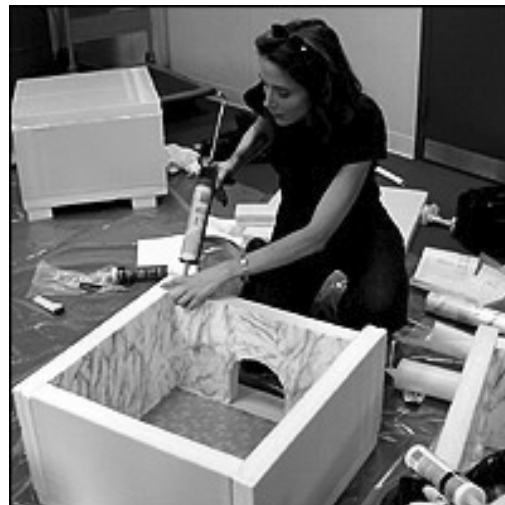
Building a feral cat winter shelter

A newsletter is in the works and NJARA is very excited to be able to network with New Jersey's feral cat caregivers in this way. They will continue to reach out to the public and educate NJ residents on the benefits of TNR. Fund raising and grant opportunities are being researched to extend the Dodge Foundation's spay/neuter Program. NJARA is striving to provide a support system for caregivers who are feeling isolated or discouraged.